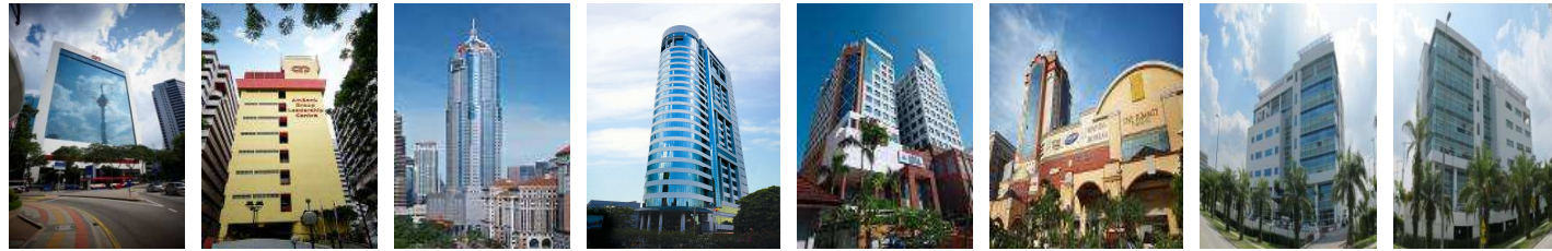
Bangunan AmBank Group ('BAG') AmBank Group Leadership Centre ('AGLC') Menara AmBank ('MAB') Menara AmFIRST ('M.AmFIRST') Kelana Brem Towers ('KBT') The Summit Subang USJ ('Summit') Prima 9 Cyberjaya Prima 10 Cyberjaya