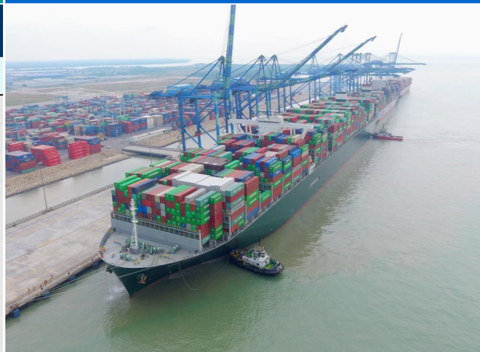
Evergreen's Ever Golden 20,150-TEU vessel making its regular call at Westports