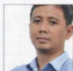
by Khairul Khalid

T HE long-awaited Kuala Lumpur-Klang Bus Rapid Transit (BRT) project is likely to be on and could be fast-tracked before the general election. It is believed that several major construction players are in the running for the project potentially costing up to RM4 bil.